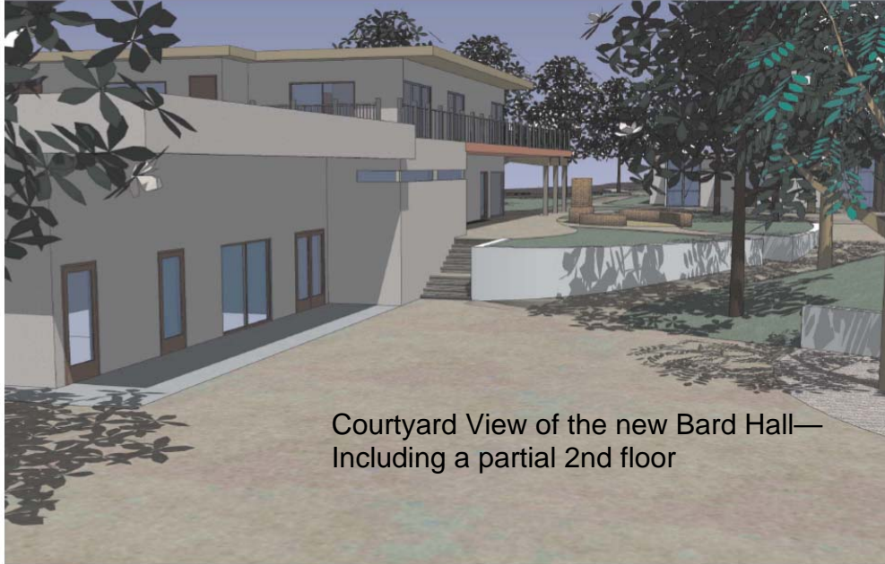
Courtyard View of the new Bard Hall— Including a partial 2nd floor

The Campus Renovation Team has partnered with our architects to develop preliminary plans for the new and expanded Bard Hall. On December 9th, the congregation will be voting on whether or not to move forward with a capital campaign to complete our vision for campus improvements and expanded program and meeting spaces.