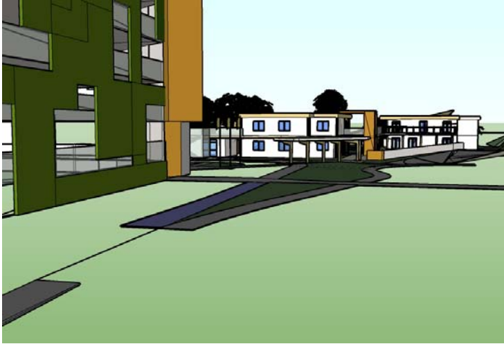
View from Arbor St with parking structure