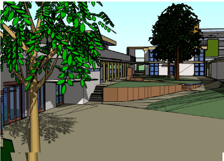
Patio view East toward Administration Building