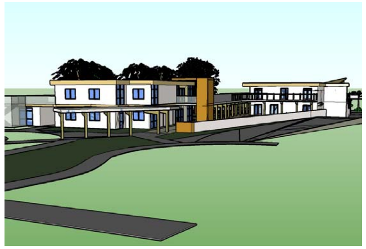
View from Arbor Street without parking structure