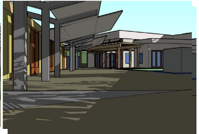
View of Bard Hall from Meeting House entrance